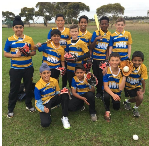
Above: Woodlea Tee-ball Team