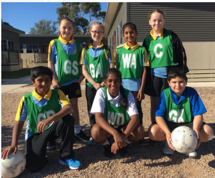
Above: Woodlea mixed Netball Team