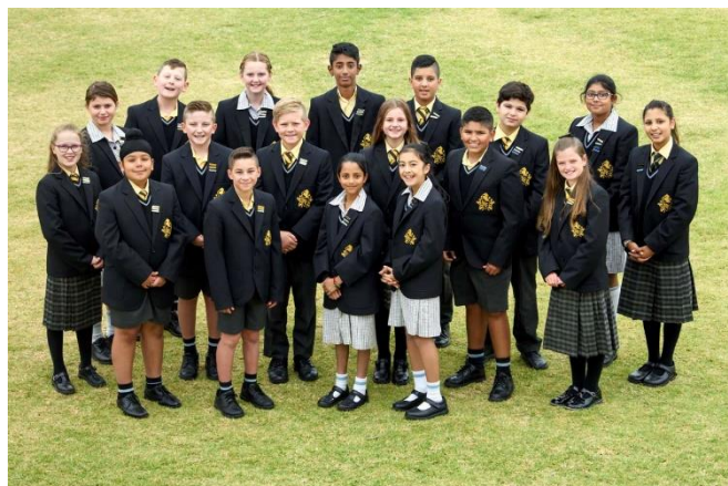
Year 6 Leaders.