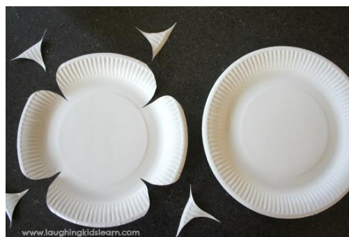
Paper plate poppy