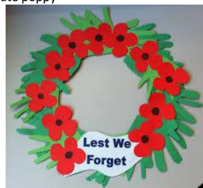
Examples of wreaths made from recycled materials