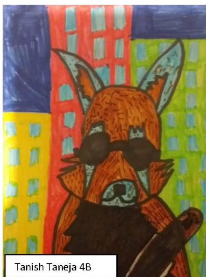
Tanish Taneja 4B