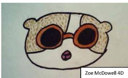
Zoe McDowell 4D