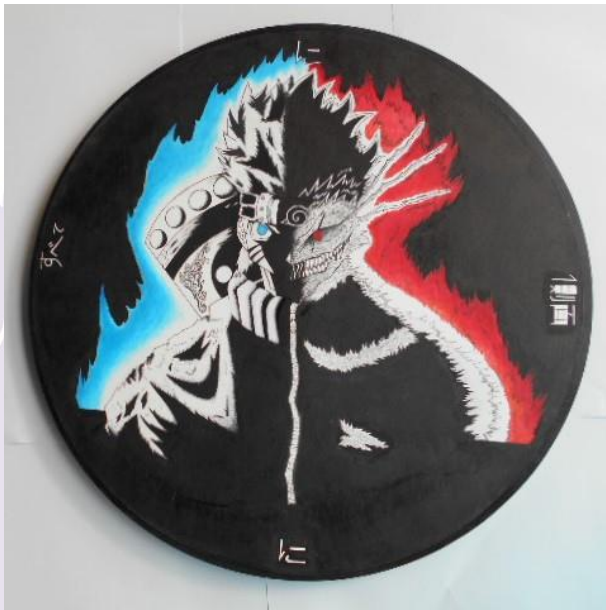
Louis Buswell – 7WA