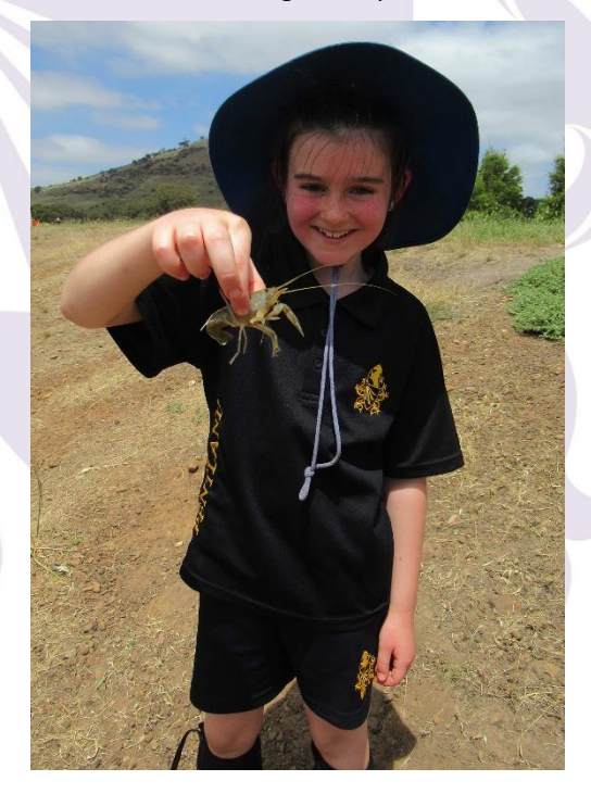
Year 3 Teams - Maddingley and Woodlea

The Year 3 students had a wonderful day at Staughton Vale on Tuesday 24 November. Students witnessed the beautiful panoramic views of Fairy Park, the You Yangs, the city and farms. They weeded and found bugs while enjoying the delicious snow peas. They put their engineering skills to great use building boats as a team and racing them across the dam. Class 3B were the yabby champions, catching 72 yabbies in total. A great day was had by all. Thanks to Year 8A and 8B students for their assistance during the day.