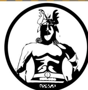
MELTON WARRIORS RUGBY UNION CLUB