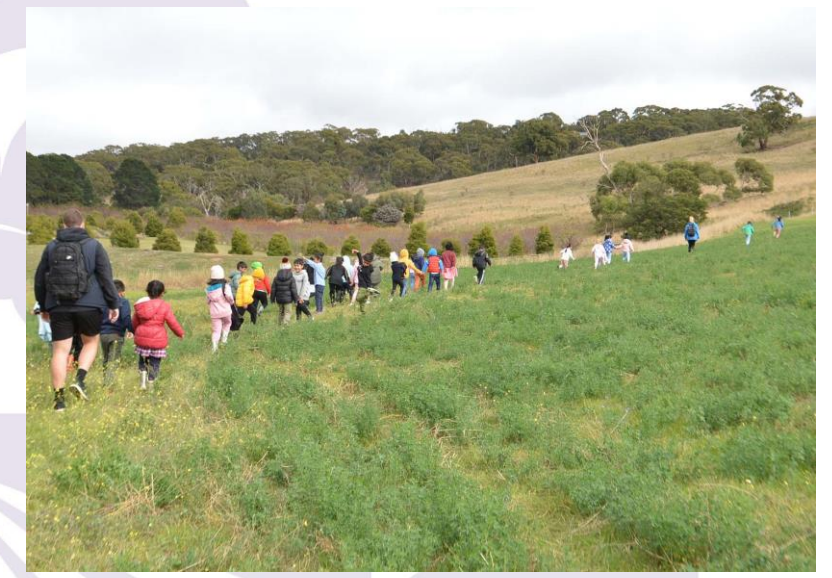
Prep visit to Staughton Vale

For our first ever excursion, the Woodlea Prep students made their way to Staughton Vale. They were excited to get on the bus and go on an adventure. The Preps were grouped for some fun activities. We climbed the steep hill and got a great view of Anakie Fairy Park from the top. The Preps also got to go on a bush walk and climbed some trees. Finally, they planted some seeds that linked in with our procedure writing unit. We were fortunate to meet the friendly sheep (Sean) that lives at Staughton Vale. They all had an amazing experience and we had some tired little Preppies on the bus when heading home!