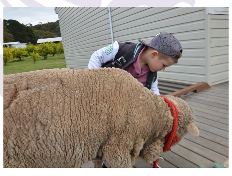
Woodlea Prep Team

For our first ever excursion, the Woodlea Prep students made their way to Staughton Vale. They were excited to get on the bus and go on an adventure. The Preps were grouped for some fun activities. We climbed the steep hill and got a great view of Anakie Fairy Park from the top. The Preps also got to go on a bush walk and climbed some trees. Finally, they planted some seeds that linked in with our procedure writing unit. We were fortunate to meet the friendly sheep (Sean) that lives at Staughton Vale. They all had an amazing experience and we had some tired little Preppies on the bus when heading home!