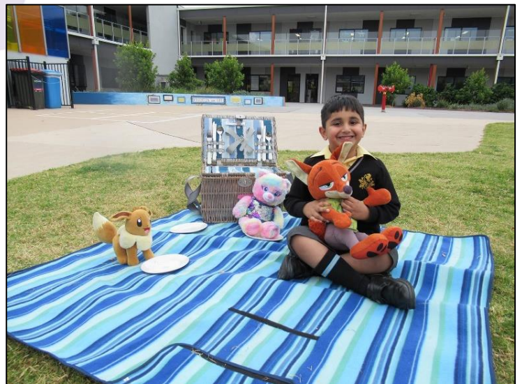
Maddingley & Woodlea Prep Teams

The day started similarly to the Maddingley Woods - sharing with their classmates the features of their teddy bears and what they like to do with their teddies. Students then made a collage of their teddy bears using colours that matched their teddies. Afterwards, all the students met with their Year 4 buddies and enjoyed a picnic eating the delicious Tiny Teddy biscuits. For Maths, the students used their shape knowledge to make a teddy bear and share the features of the 2D shapes. Finally, students wrote phenomenal recounts using their understanding of complex sentences to recall their day with the teddies.