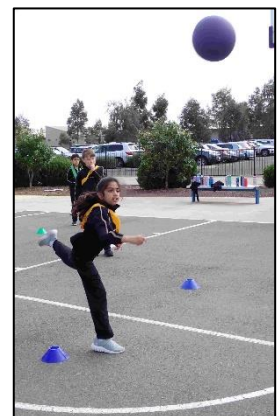
Woodlea Junior School Physical Education Teachers

We appreciate your continued support of these activities which significantly contribute to your children’s development and enjoyment.